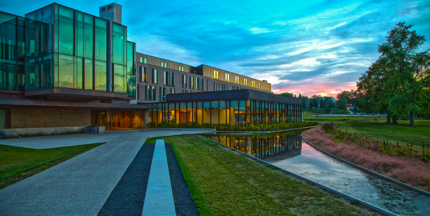
Richard Ivey Building, Ivey Business School at Western University, London, Ontario, Canada