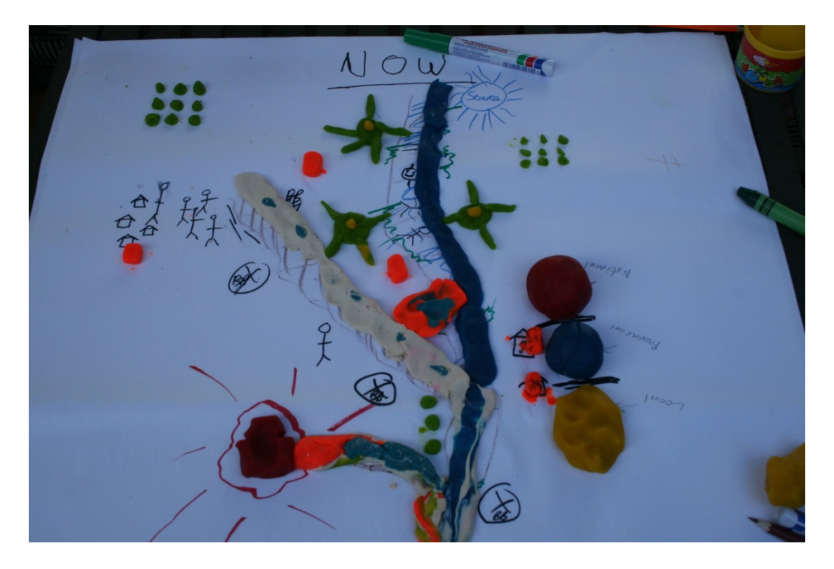
Figure 2: The Eerste River catchment June 5, 2013